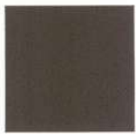
Jet Black (2)