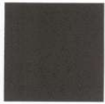
Black Velvet (2)