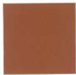
Desert Red (2)