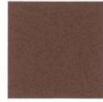
Red Rock (2)